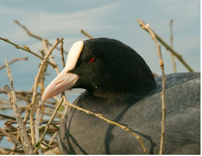
Common Coot