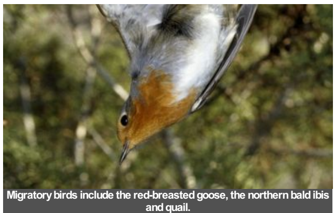
Migratory birds include the red-breasted goose, the northern bald ibis and quail.

CYPRUS - FAMAGUSTA GAZETTE • Tuesday, 10 May, 2016